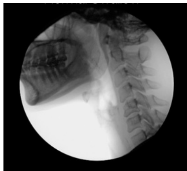
VFSS: Video X-rays are obtained during a swallow

An alternative procedure to assess swallowing is the Videofluoroscopic Swallowing Study (VFSS). Although both FEES and VFSS provide objective information on the patient's swallow profile, FEES has the added advantage of allowing the Speech Therapist to visualise the larynx (voice box). The Speech Therapist will decide on the most appropriate objective assessment based on the patient's swallow profile and medical status.