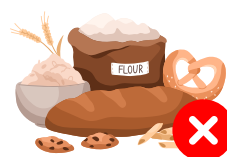
Whole grains/ oats