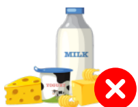
Milk, yoghurt, cheese, butter