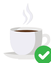
Coffee/tea (no milk)