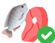
Lean meat (chicken/fish)