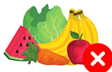
Fruits and vegetables