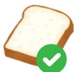
White bread (no spread)