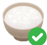
White porridge/ rice