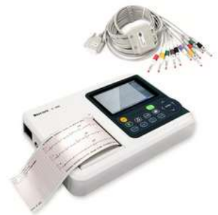
Monitoring equipment to be used includes electrodes, a small monitor device and cables.

An electrocardiogram (ECG) is a recording of the heart's electrical activity. A 24-hour ambulatory ECG monitoring test, also called the Holter monitoring test, records heartbeats over an entire day so that as many as 100,000 heartbeats are recorded by a recorder worn by the patient. In contrast, routine ECGs record your heartbeats over a period of 10 seconds. These ECG records are then analysed to look for any abnormalities in heart rhythm and rate.